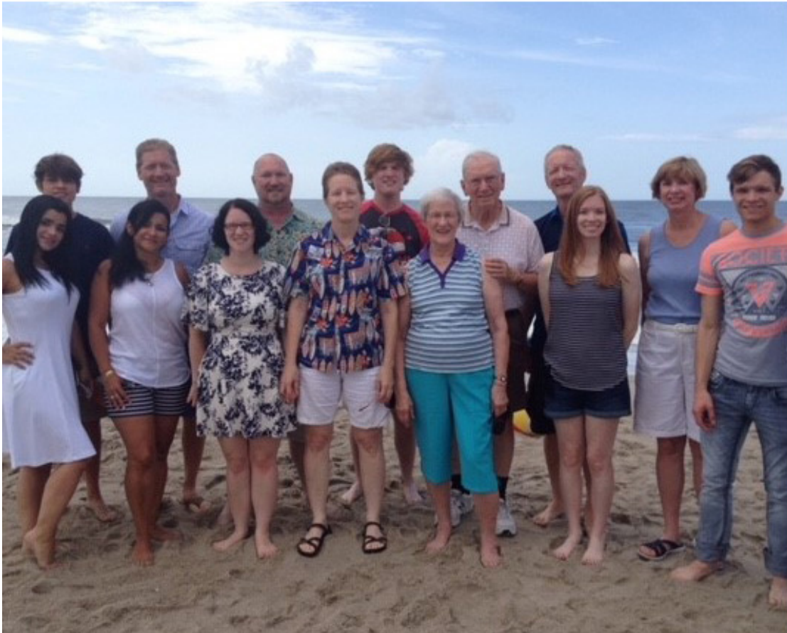
All of the family with children and grandchildren in Oak Island 2016