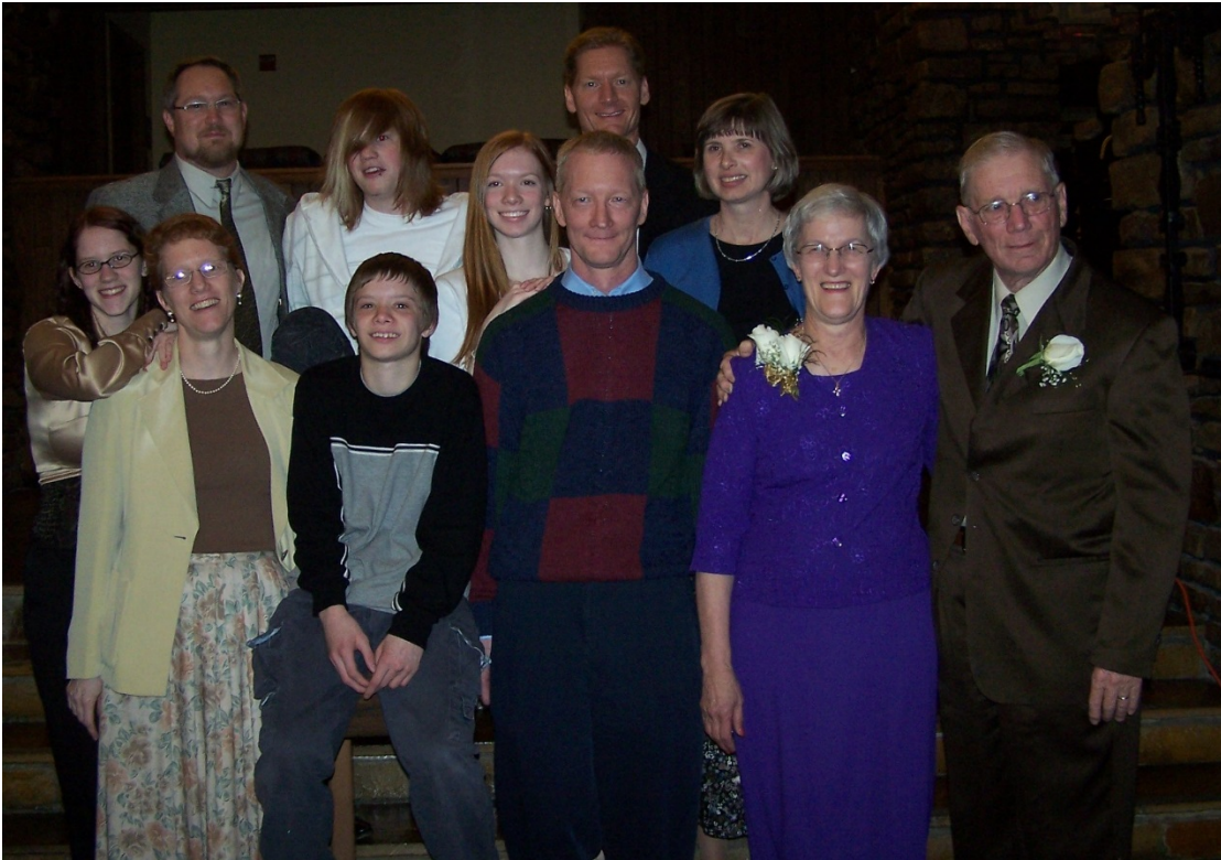
Immediate family at the 50 th Wedding anniversary celebration 2008

Year 2008, celebrated our 50 th wedding anniversary with a trip to Hawaii and a celebration dinner. The annual golf tournaments in Omaha and back here in Bella Vista. We are always keeping busy with our daily activities.